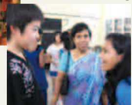
Fukushima Youth Ambassadors 2011

There will be various preparations that need to be carried out before and during