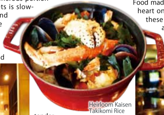
Heirloom Kaisen Takikomi Rice

And lastly, a generous portion of wagyu rib fillets is slow-cooked in sake and dashi for three hours before being served. As a result, the fillets become so flavoursome and